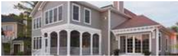
CELECT® CELLULAR COMPOSITE SIDING