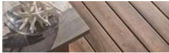
ZURI® PREMIUM DECKING