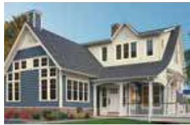
CRANEBOARD® SOLID CORE SIDING®