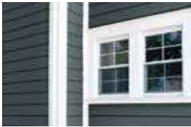
ROYAL® TRIM & MOULDINGS