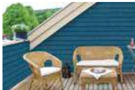
PORTSMOUTH™ SHAKE & SHINGLES