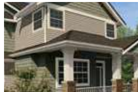
EXTERIOR PORTFOLIO® SIDING