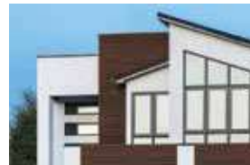
CEDAR RENDITIONS™ ALUMINUM SIDING