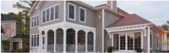
CELECT® CELLULAR COMPOSITE SIDING