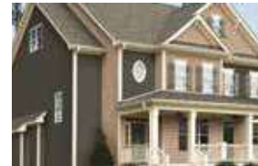
ROYAL® SHUTTERS, MOUNTS & VENTS