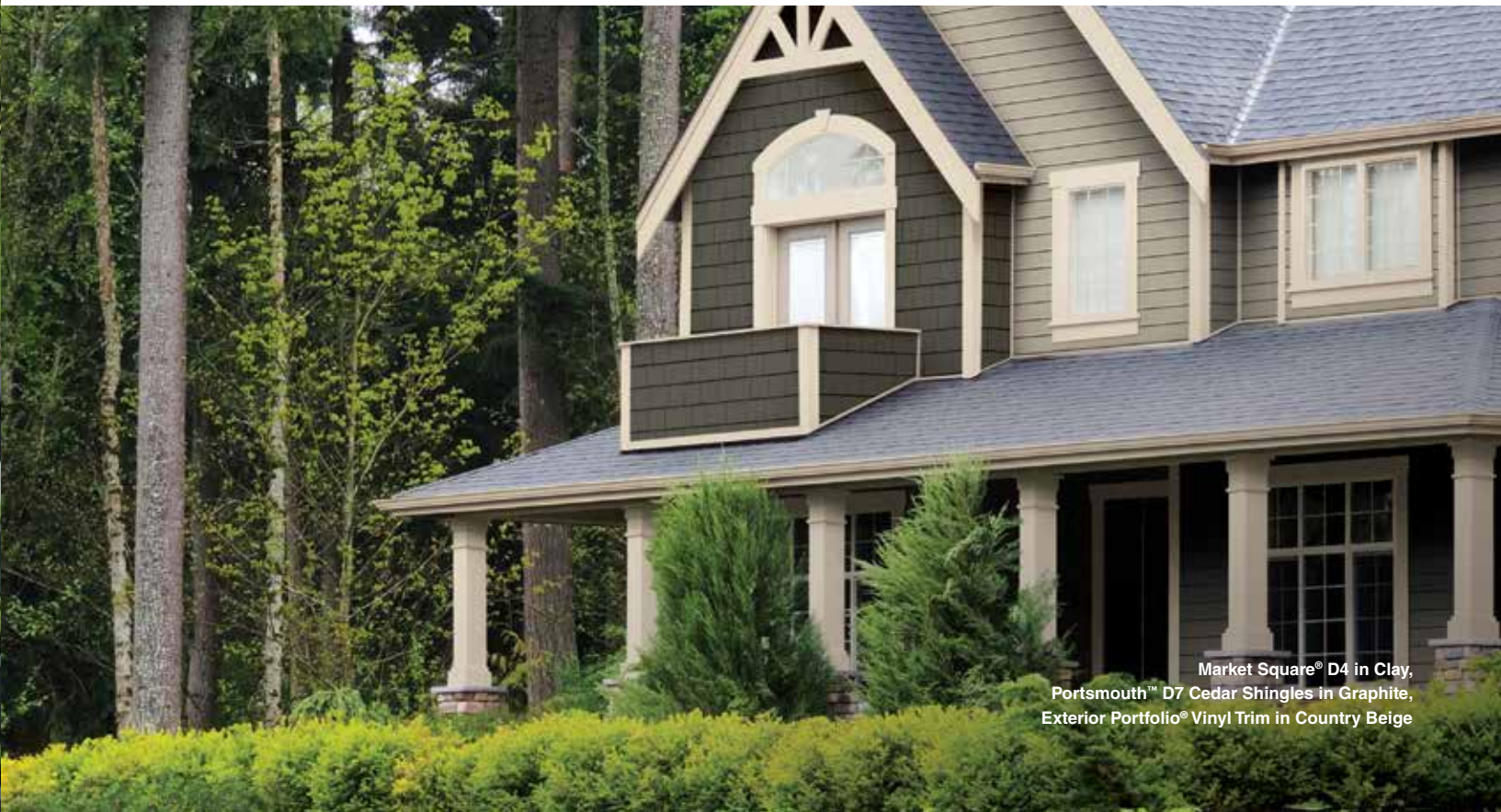
Market Square® D4 in Clay, Portsmouth™ D7 Cedar Shingles in Graphite, Exterior Portfolio® Vinyl Trim in Country Beige