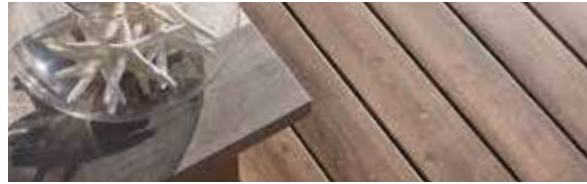
ZURI® PREMIUM DECKING