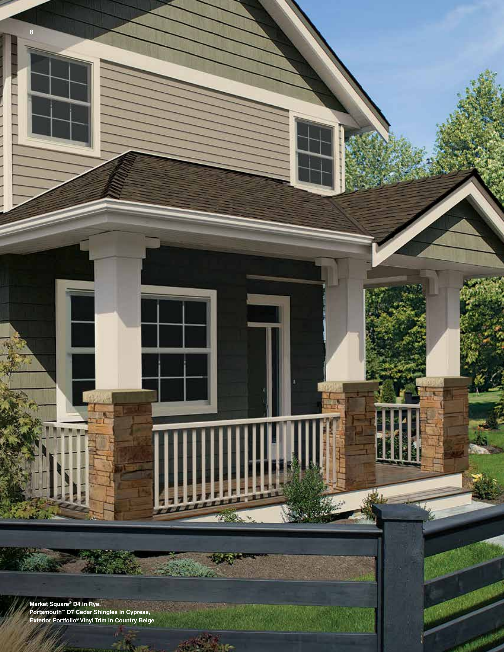
Market Square® D4 in Rye, Portsmouth™ D7 Cedar Shingles in Cypress, Exterior Portfolio® Vinyl Trim in Country Beige