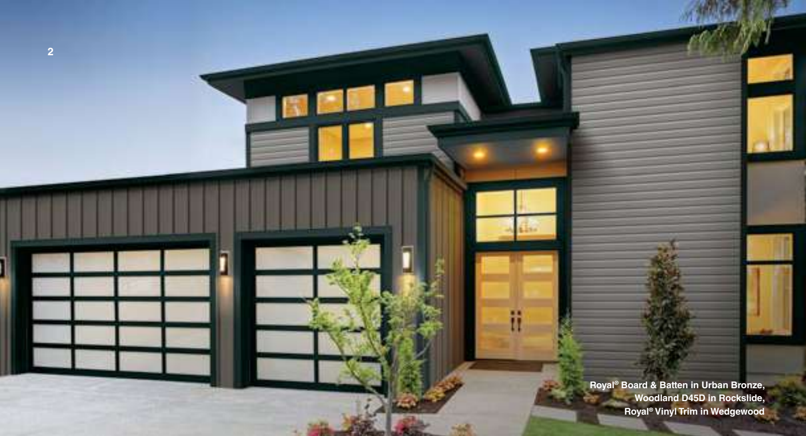
Royal® Board & Batten in Urban Bronze, Woodland D45D in Rockslide, Royal® Vinyl Trim in Wedgewood