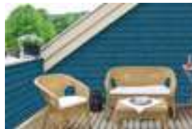
PORTSMOUTH™ SHAKE & SHINGLES