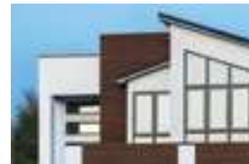
CEDAR RENDITIONS™ ALUMINUM SIDING