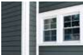
ROYAL® TRIM & MOULDINGS