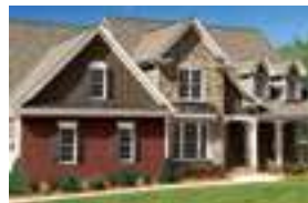
HAVEN® INSULATED SIDING