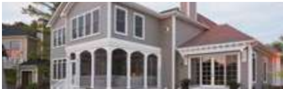
CELECT® CELLULAR COMPOSITE SIDING