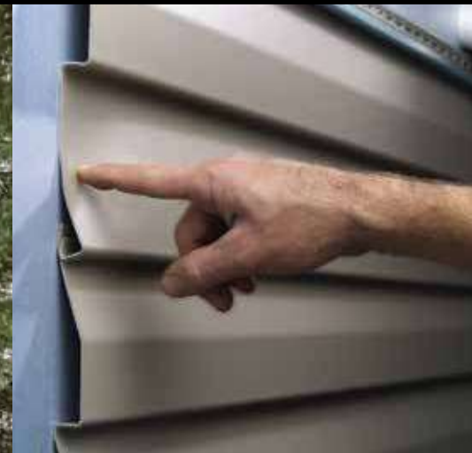
Traditional siding yields a hollow void between the siding and the wall.