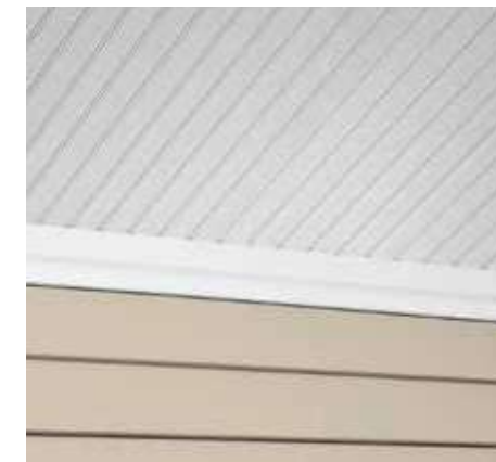
Greenbriar® Vintage Beaded soffit and Trimworks soffit crown molding.