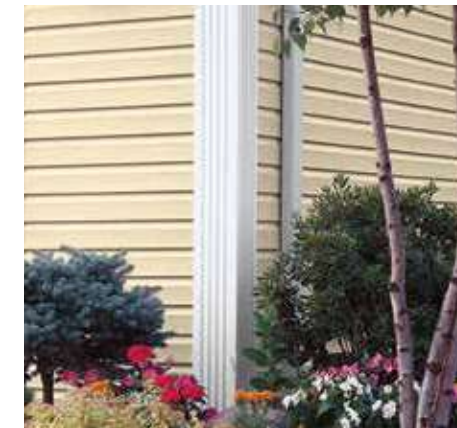
Trimworks® 7" fluted corner post.