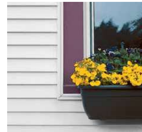
Trimworks custom crown molding used with wood window trim.