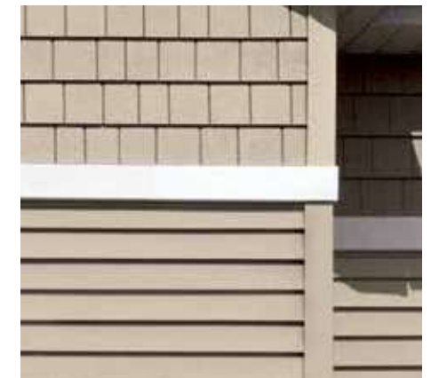
Horizontal band board provides a strong horizontal accent.