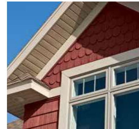
Alside Premium Scallops – Victorian inspired half-round shingles.