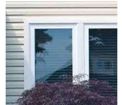
Charter Oak dutch lap with Trimworks 3-1/2" window trim.