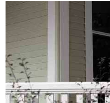
Trimworks three-piece beaded corner post.

Alside offers a wide selection of trim and accent products made to complement the beauty and colors of Charter Oak Energy Elite siding.