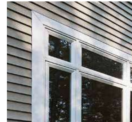
Charter Oak clapboard with Trimworks 5" window trim.