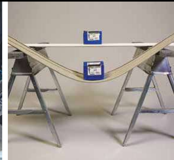
In strictly controlled laboratory comparisons, Charter Oak remained rigid, while the competition sagged.

CHARTER OAK ENERGY ELITE IS AN INVESTMENT that really pays dividends. Energy savings and freedom from maintenance are so desirable that chances are your new siding can more than pay for itself in increased home value. And it will always be a pleasure to live with.