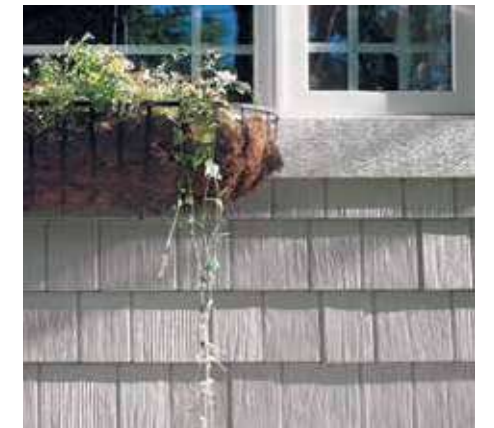
Alside Premium Shakes – the classic look of deep-grained cedar shakes.