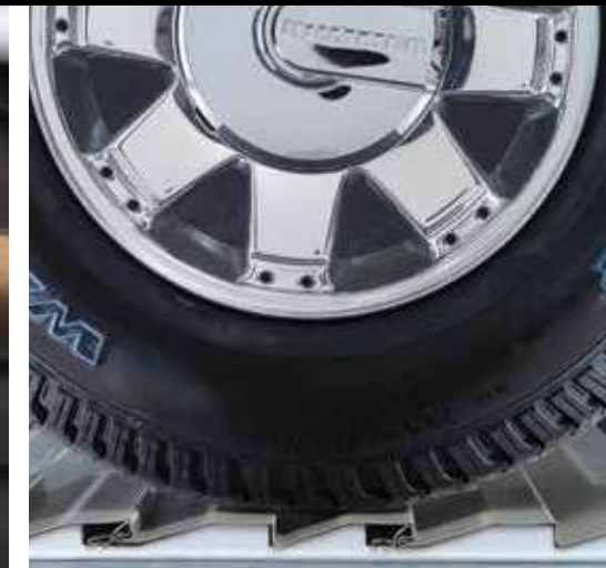
Contoured insulation give Charter Oak Energy Elite additional support and increased durability.